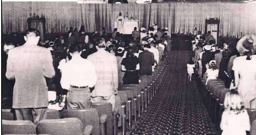
Fotografías de las primeras Misas en el Teatro Panorama