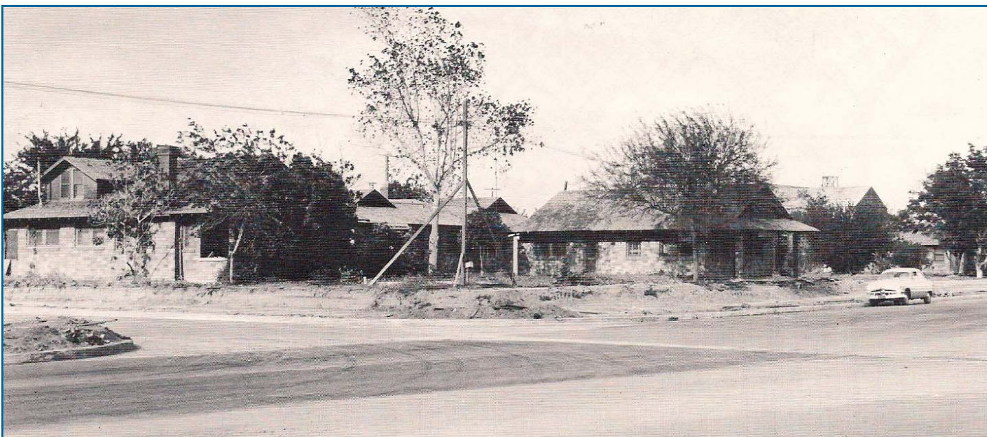
September 1950 - View of the corner of Roscoe and Hazeltine showing first convent (left) and first chapel (right) where Mass was offered until August 26, 1951. Septiembre 1950 - Esquina de Roscoe y Hazeltine, a la izquierda se aprecia el primer convento y a lado derecho la primera capilla donde se

FEBRUARY 14, 2010 • SIXTH SUNDAY IN ORDINARY TIME