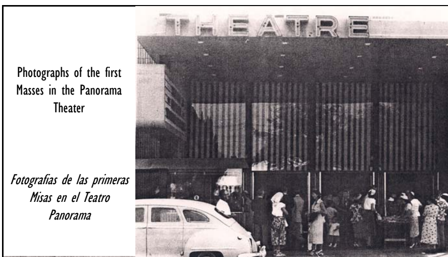
Photographs of the first Masses in the Panorama Theater