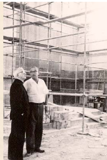
Timothy Cardinal Manning Archbishop of Los Angeles