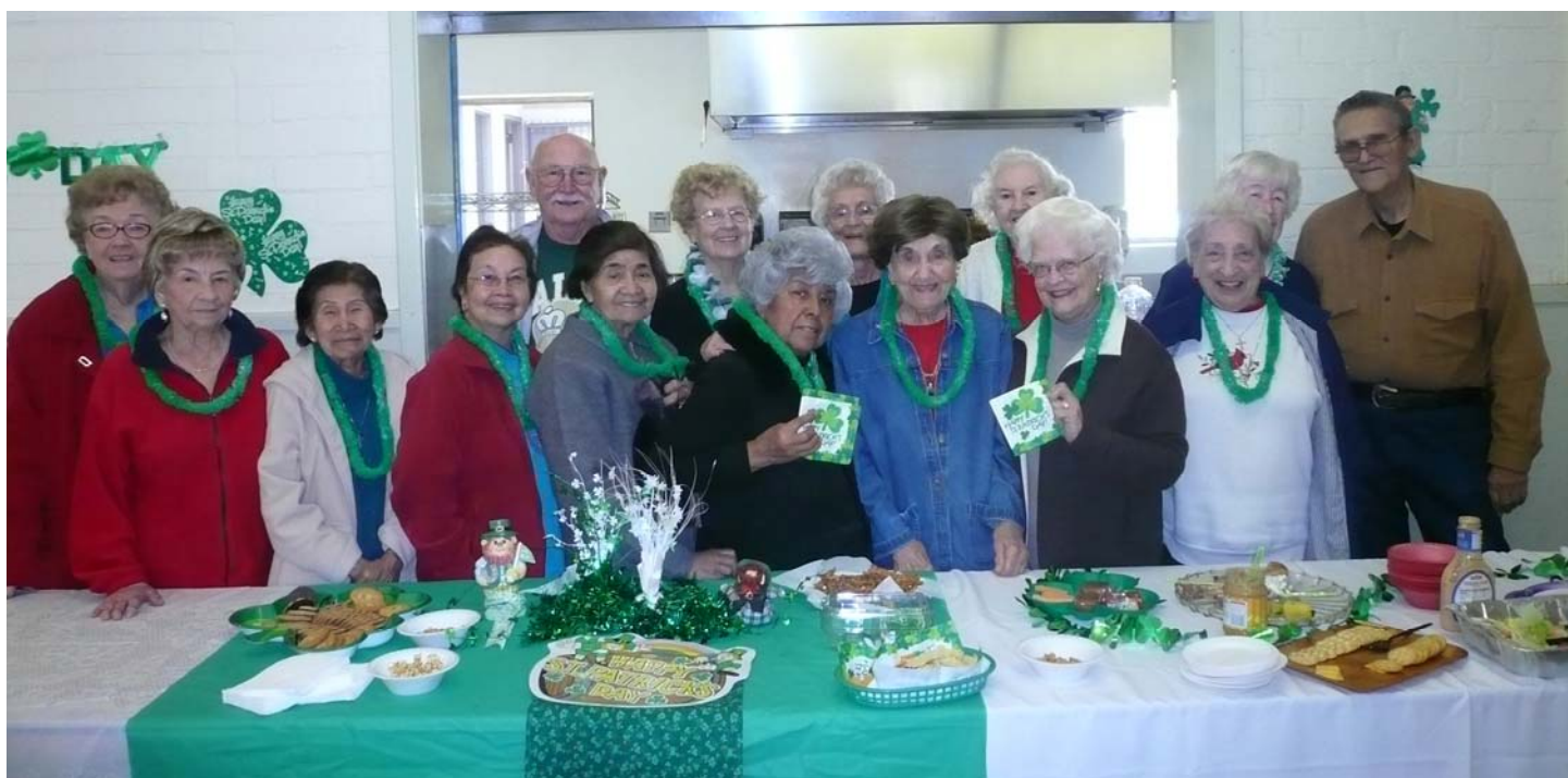
55+ Club celebrates Saint Patrick's Day