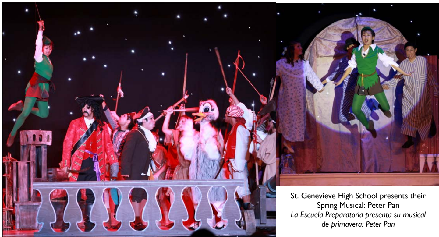
St. Genevieve High School presents their Spring Musical: Peter Pan La Escuela Preparatoria presenta su musical de primavera: Peter Pan